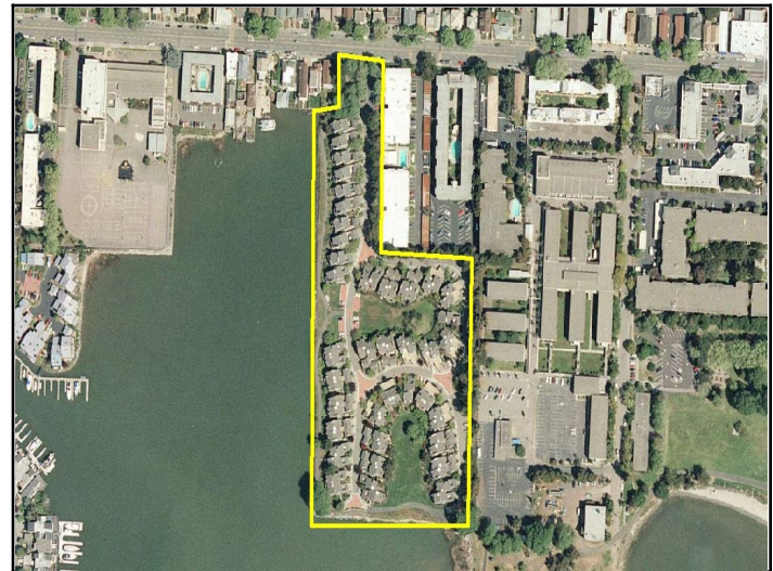
Irrigated Area at 1356 Crown Dr

Customer Name: Crown Harbor Hoa Service Address: 1356 Crown Dr City: Alameda Account #: 27356200001 Meter #: 14831909 Est. Irrigated Area(sq. ft): 203955